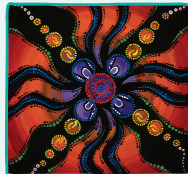
Reconciliation, Knowledge and Togetherness - By Anita Morena

The tree and all branches symbolise the possible support we can find for our vulnerable children. The kangaroos sit as protectors; with happy children near-by, safe houses, and our specialist teams' services and their conversations and assistance, painting a detailed picture of how our children are protected within our communities.